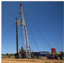
Geothermal Project in California Is Shut Down