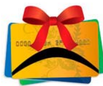
The Lure of Store Credit Cards, and the Hook