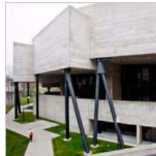
Bigger Arts Buildings May Not Be Better