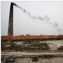
Room for Debate: Climate Aid for Poor Nations?